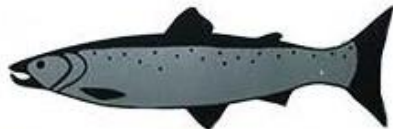
Blue Ridge Timber Cutting