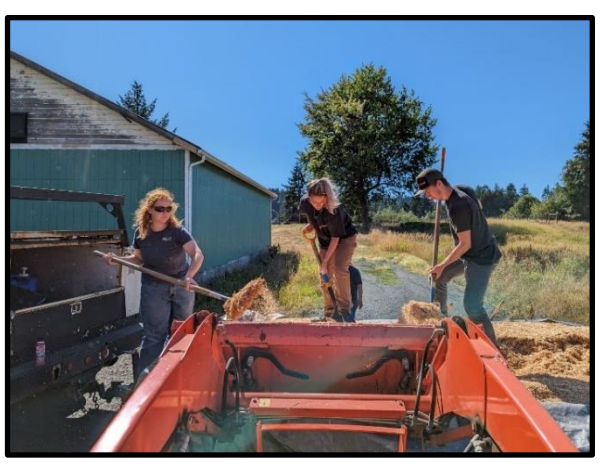
Left: Matson Creek Wetland Preserve nursery, barn, and future site of Community Education Center. Right: Summer youth crew unloading mulch from newly purchased tractor.